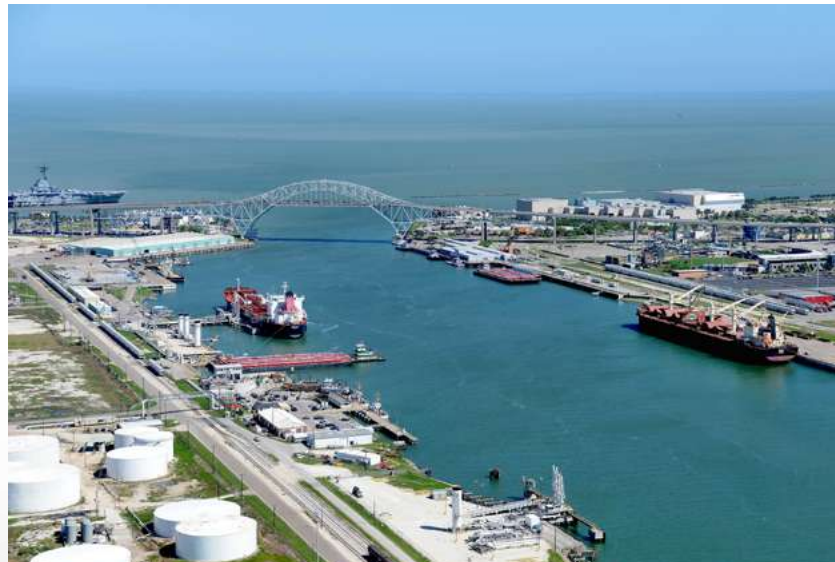
CLOSE PROXIMITY TO PORT CORPUS CHRISTI (±13 MILES)