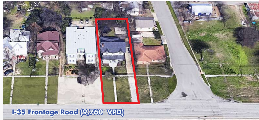
I-35 Frontage Road (9,760 VPD)